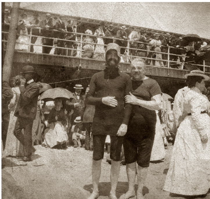
With an unidentified buddy at the Jersey shore